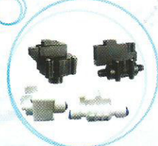
L.p. Switch & H.p. Switch