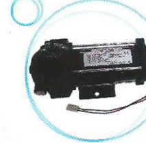
BNQS 400 GPD