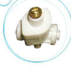
Tds Adjustment Valve