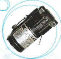
BNQS 75 GPD