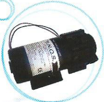
BNQS 100 GPD