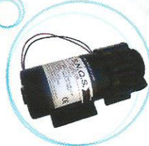
BNQS 150 GPD