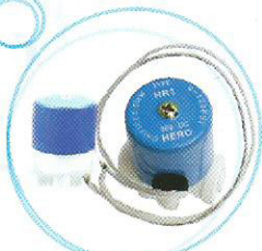
Hero SV 24v/36v pf & nf