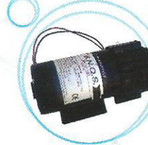
BNQS 300 GPD