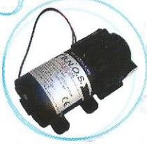
BNQS 50 GPD